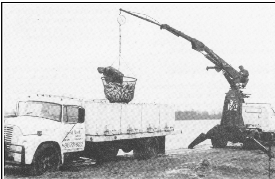
Transport truck used to load live catfish.

A popular anesthetic is MS-222. It is approved for use on food fish, and a 21-day withdrawal period is required before fish are consumed. The recommended level of anesthesia during transport should permit fish to be caught easily by hand but not cause total loss of activity or equilibrium. MS-222 is used at 15 to 66 ppm for 6 to 48 hours to sedate fish during transport.